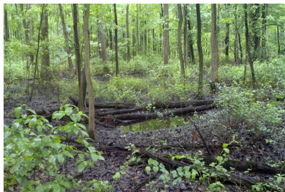
Above, a vernal pool in Burlington County. Vernal pools are rare and require a 150-foot buffer from development.

On a similar project, SAI reviewed a previous consultants' work for a parcel of land in Cape May County that was erroneously described as having "facultative" vegetation (meaning slightly wetter than dryer),