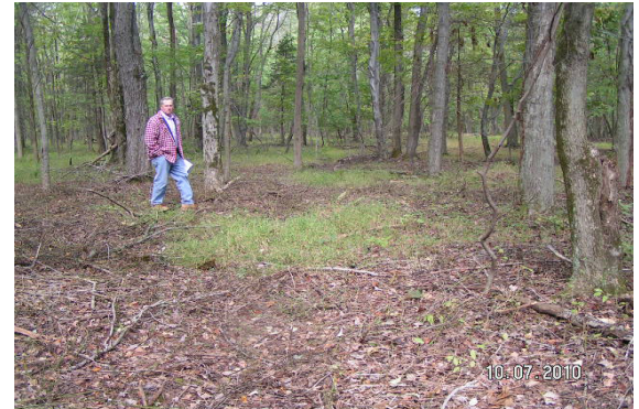
Above, Randy Kertes, SAI's Director of Land Use & Environmental Services, considers an upland project site that had been erroneously classified as a freshwater wetland.

The implications of an incorrect determination can extend well beyond the boundaries of the actual area